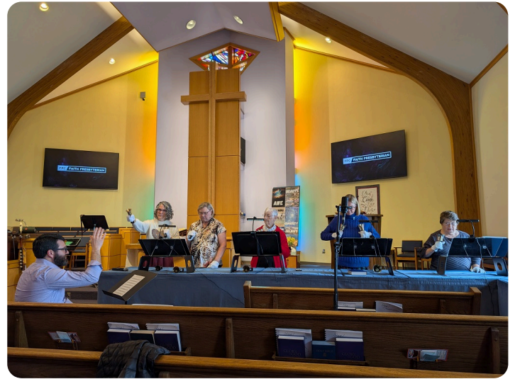
Performance by the Faithful Ringers