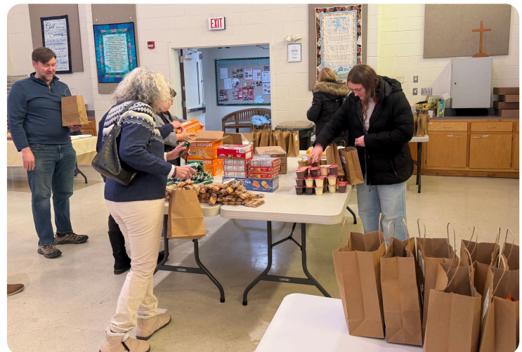
Packing care bags for Daybreak during Sunday Morning Together.